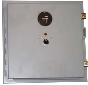
Control Panel with Running Time Meter and On / Off Power Switch

An Ultraviolet Disinfection System is an effective way to provide bacteria free water for your home or industry 24 hours a day, 7 days a week. Today's Ultraviolet Disinfection Systems are setting the standards for water disinfection requirements in the water treatment industry.