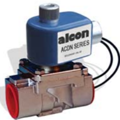
ACDN Series Solenoid